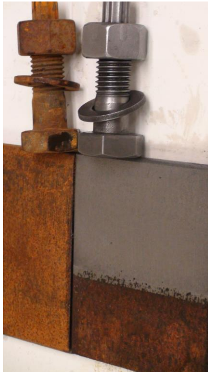
Protected with AR5300