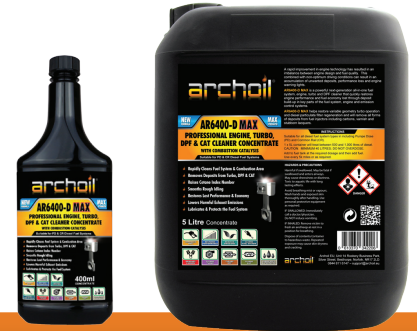
AR6400-D MAX - Friction Test Results